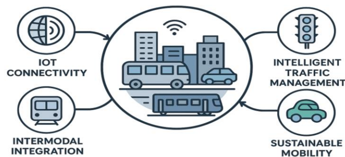
Figure 1: Framework of Smart and Integrated Transport Infrastructure