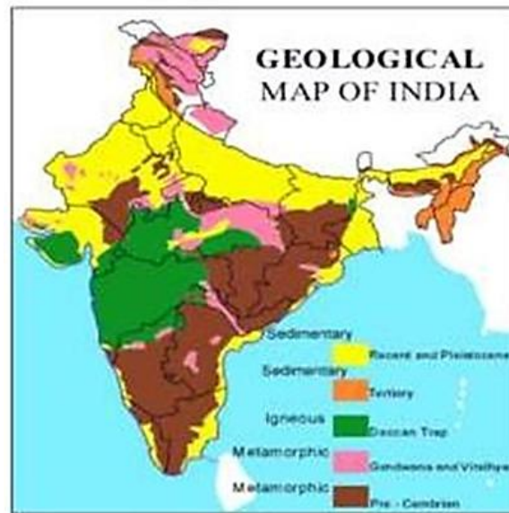
The Representative Figure Shows the Distribution of Various Rocks in India with Different Geological Periods.

Gondwana rocks, and quaternary to late sedimentary stores. The geological chart [4] depicts the categorization of various rock types.