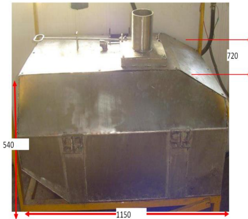
Fig.1 Important Dimensions and Volume of Bio-digester Tank