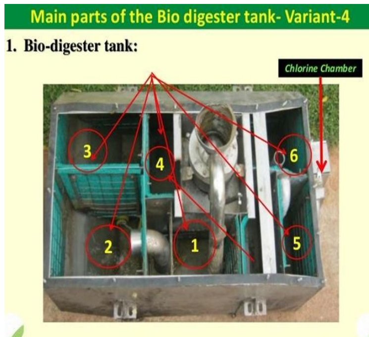
Fig.2. Main parts of Bio-digester Tank