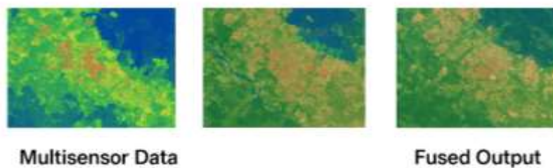
Figure 2: Example Output of Multisensor Data Fusion using Deep Learning