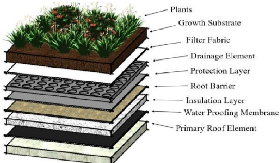
Figure 2: Layers of a Typical Extensive Green Roof