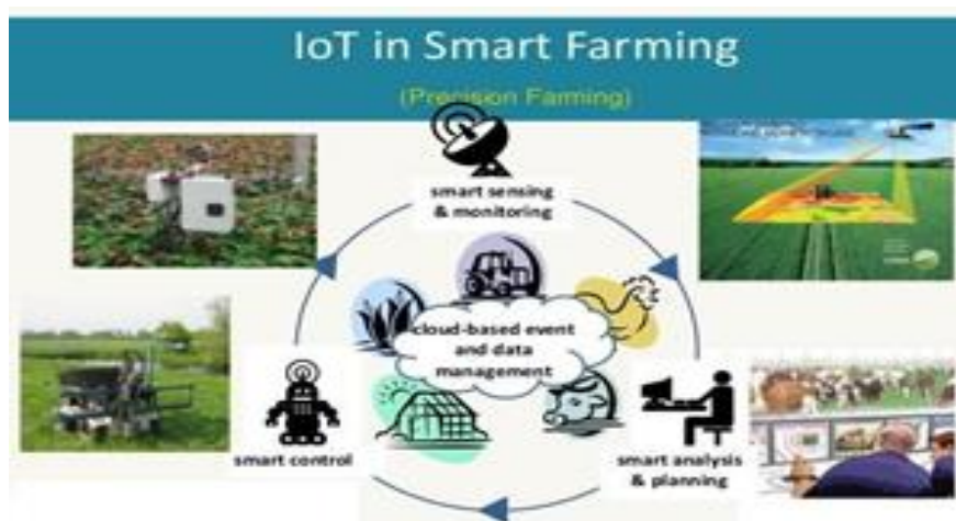
Figure 1: IoT in Smart Farming

In paper [4] there are three different methods has been carried to test the soil, they are moisture test, respiration test and bulk density test. Soil moisture test is to be performed first because it plays a key role in exchange of water and heat energy between the land surface and the atmosphere, through evaporation and plant transpiration.