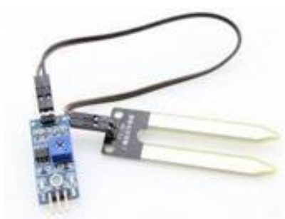
Figure 2: Soil Moisture Sensor