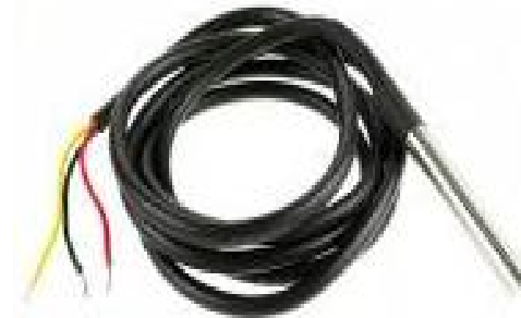
Figure 1: DS18B20 Waterproof Temperature Sensor

55 0 C to +125 0 C; Converts temperature to 12-bit digital word in 750ms.