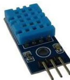
Figure 3: Humidity Sensor