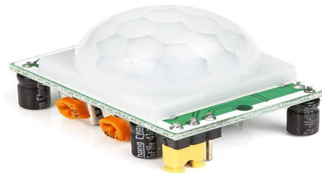
Figure:-1 Motion sensor