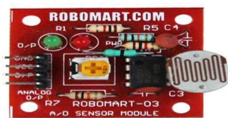
Figure:-2 LDR sensor