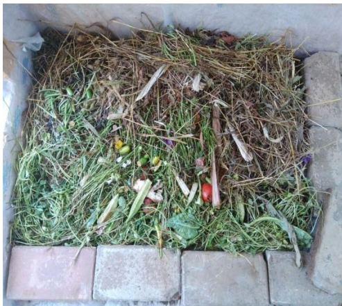
Figure 3.12: Sample composting

compost manure was ready and also final readings were taken.