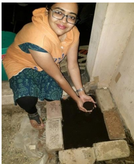
Figure 3.14: Compost manure (Final product)