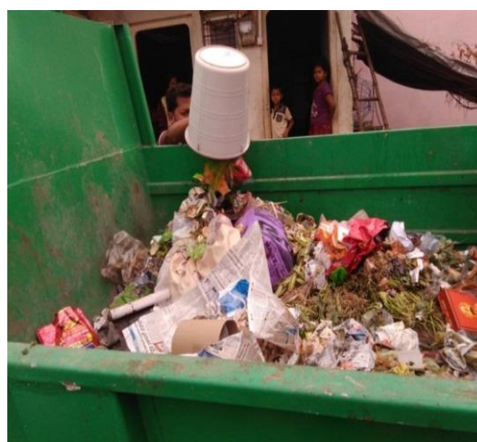
Figure 3.3: Collection system in village

from marriage halls, waste from hotels etc. and dumps it to the dumping site which is approximately 1.5 km away from village. The present situation of dumping site is very miserable