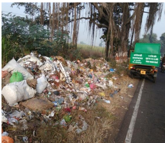
Figure 3.4: Disposal site