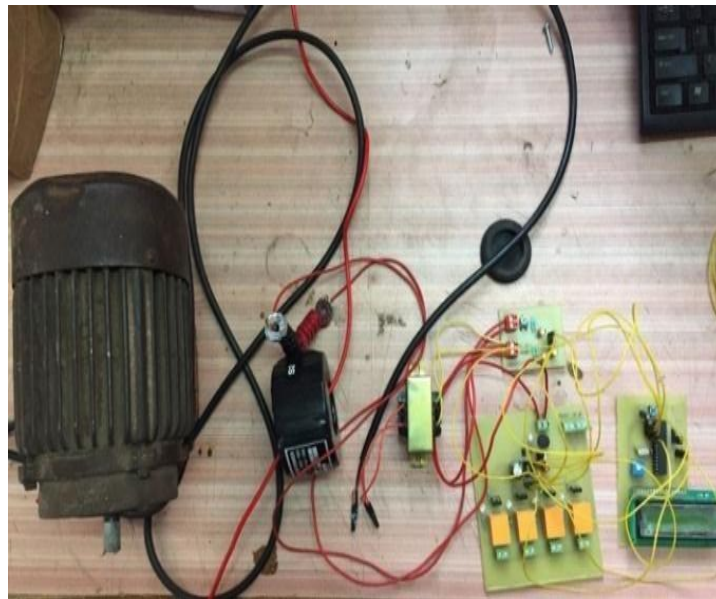
Fig -3: Hardware setup

The proposed work can be explained in the form of block diagram as shown in figure 3. It comprises of following 9 blocks,