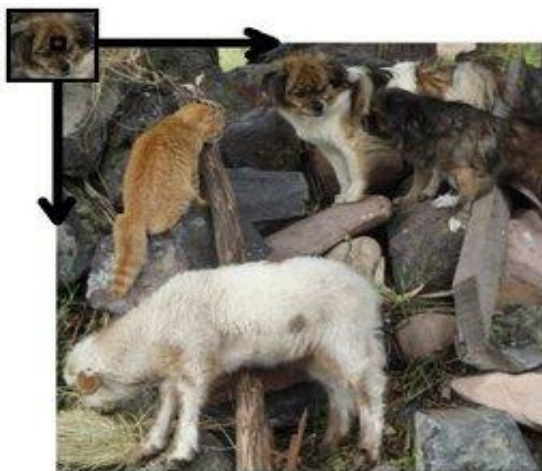
Figure 2 Output image

To identify the matching area, we have to compare the template image against the source image by sliding it.