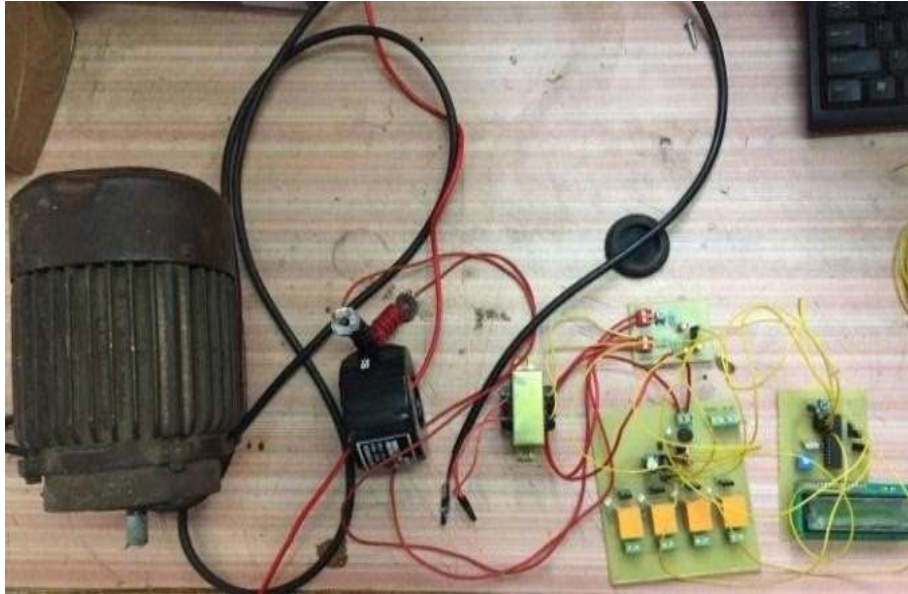
Fig -3: Hardware setup

The proposed work can be explained in the form of block diagram as shown in figure 3. It comprises of following 9 blocks,