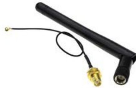
Figure 4: Wireless Gain Antenna for Serial WIFI

antenna of Serial WIFI wireless Gain Antenna (shown in Fig. 4) can be utilised as an alternative. The live wire status may be identified before 5 metres using this antenna.