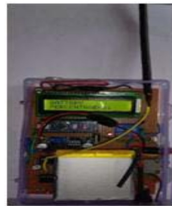
Figure 5: Live Wire Detector Prototype Model

mode, and L8 begins to illuminate (indicates the fully charged condition of battery). This circuit is used to prevent battery overcharging and to keep the battery safe. The adapter circuit can be linked to the charging circuit through a USB connector and a 1A fuse to limit the current flow. The prototype model of the Live Wire Detector is depicted in Fig. 5.