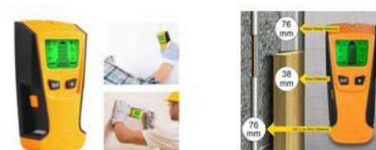
Figure 1 shows an existing live wire detector.

As a fared device, it cannot be caused anywhere; however, it is not waterproof, which is a required feature, and it has no lifetime duration for a protective device in an existing method in a discussion live wire coverage these are no longer available of more than 3 metres, which poses the greatest risk to any users. Some of the devices on the market have many functions, such as detection of metal rebar, studs, and AC live wires, and one of these devices is depicted in Fig.1. Existing commercial detectors perform admirably and provide a near-perfect forecast of the AC live wire situation behind the wall.