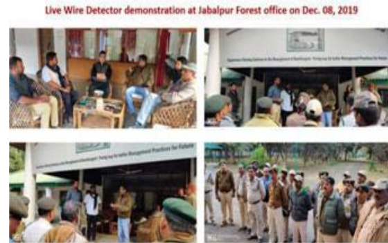
Figure 7: Prototype demonstration at Jabalpur's Bandhavgarh National Park.

the prototype model with the electrical fence system set up by the Bandhavgarh National Park in charge, as seen in Fig.7.