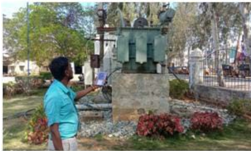
Figure 6: Testing of the Live Wire condition using the suggested model (Venue: Kuppam Engineering College Campus)

power lines within the wall nearly 0.5 feet before it detects the AC power via the insulated cables 1.5 feet before it detects the AC power through the insulated cables. The detection coverage distance is substantially greater than that of existing devices on the market.