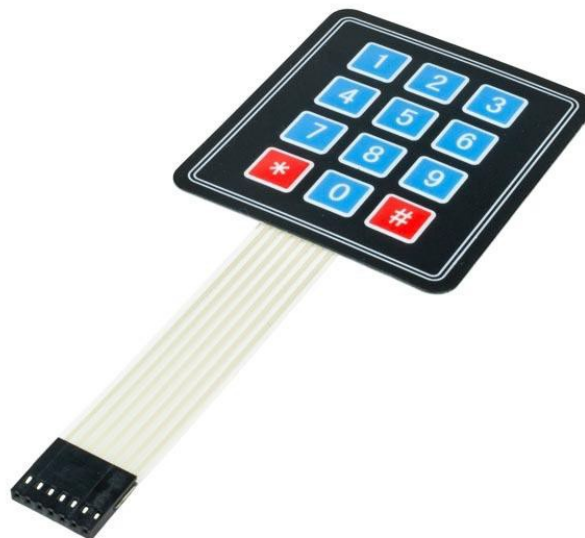
Figure 2: 4 X 3 membrane keypad