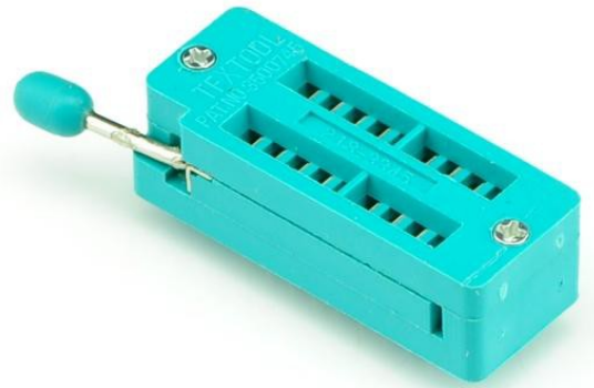
Figure 3: 16 pin ZIF socket

The keypad makes use of a 4 row - 3 column matrix keyboard and is connected to port B of the microcontroller. The key positions are shown in Figure (2). The principle of detecting a key is by getting a logic value on the pins of the microcontroller.