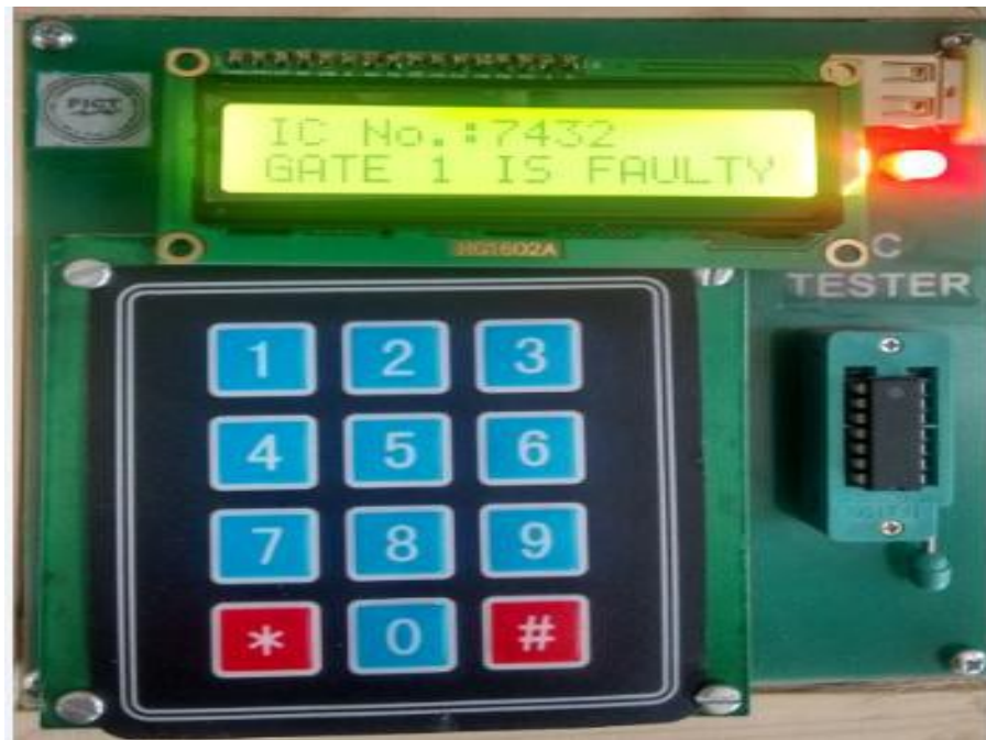
Figure 8: Testing of 7432 (Not-working IC)