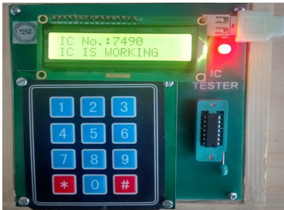
Figure 7: Testing of 7490 (Working IC)