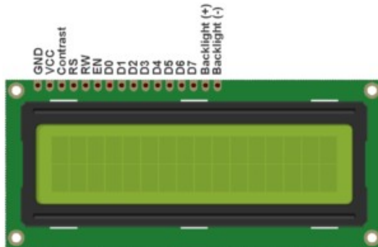
Figure 4: 16 X 2 LCD

To display the result and for interaction with the user HD44780 Liquid Crystal Display is used. This is a 2 line, 16 characters LCD with 16 input pins. LCD is used in 4 bit mode. It is connected to the PORT A of microcontroller. LCD is shown in figure 4.