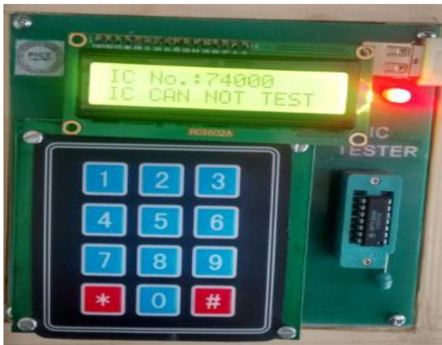
Figure 9: Result for incorrect IC number