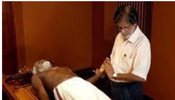
Figure 3: Diagnostic Methods in Vyavahara Ayurveda

Ayurvedic diagnostic techniques, rooted in centuries-old knowledge, continue to play a significant role in forensic investigations and legal proceedings. Methods such as Nadi Pariksha (pulse examination) and Rogi Pariksha (patient examination) provide valuable insights into a patient's health status and aid in the determination of legal matters. The integration of these diagnostic protocols into legal frameworks enhances the accuracy and comprehensiveness of medical evaluations, thereby contributing to fair and just outcomes.