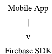
Figure 1: Firebase Backend Architecture