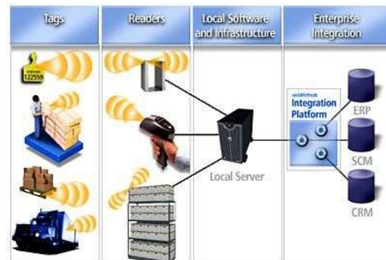
Figure 2: Real Time Location system (RTLS)