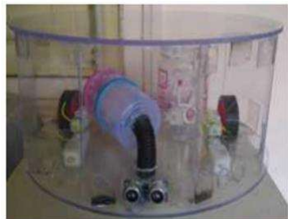
Fig 3: Working model prototype

Long duration1, distance1, duration2, distance2, duration3, distance3; Digital Write (trigPin1, LOW); // Added this line Delay Microseconds (2); // Added this line duration1 = pulse in (echoPin1, HIGH); distance1 = (duration1/2) / 29.1; Serial. Print (distance1); Serial.println (" cm 1 "); Serial. Print (distance2); If (distance1 < 8 && distance2 > 8 && distance3 > 8) { // this is where the LED On/Off happens Analog Write (speed PinA, 80); Digital Write (dir2PinA, HIGH); digital Write (dir1PinA, LOW); Delay (1000); return; } If (distance1 < 8 && distance2 < 8 && distance3 > 8) { // this is where the LED On/Off happens