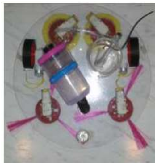
Fig 2: Final arrangement of the components on the chassis

The sponges are strategically placed at the bottom of the rear portion of the robot. This way, the sponges also provide a cushion to the robot. This is beneficial in more than one way.