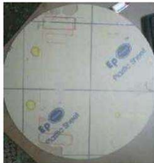
Fig 1: Final Chassis material selected – Acrylic

Once the chassis was selected and the required drill holes and cut outs were made, the next stage was to place the components. The placement of the components is discussed below.