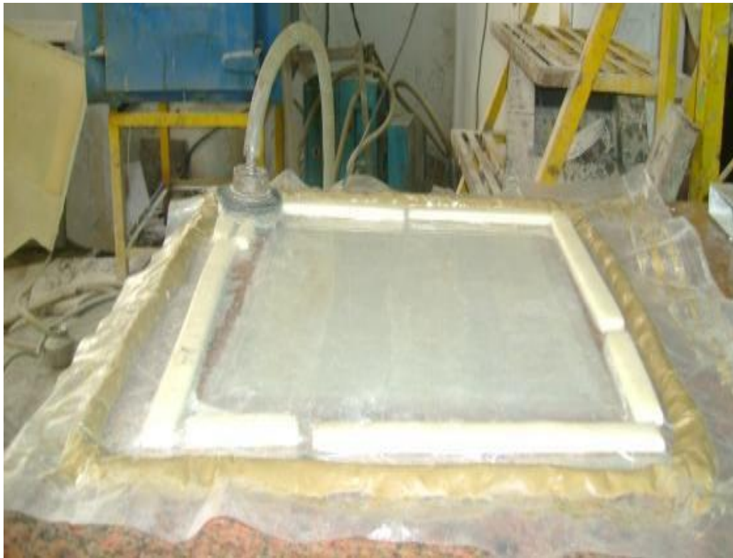
Figure 1: Manufacture of Glass fiber laminate using Vacuum hand lay – up technique

An adhesive made from a mixture of LY556 resin & HY 951 hardener mixed in the ratio of 100:10 by weight was then applied. Vacuum hand lay – up technique (Figure 3.1) was used to make the specimens. Vacuum level (500 mm of Mercury for 2 hours) was monitored so as to avoid surface undulations and also avoid air pockets at the interface.