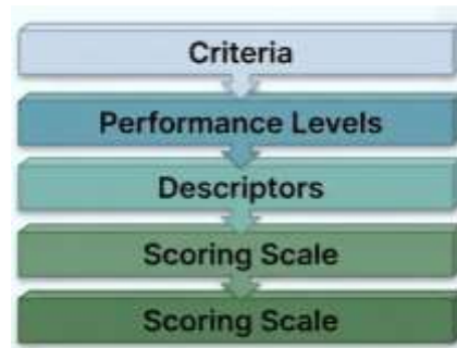
Figure 1: Structure of a Rubric