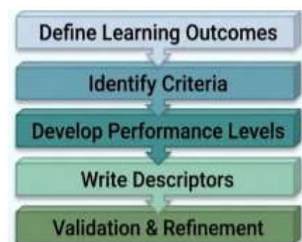
Figure 2: Rubric Design Process