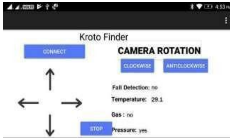
Fig. No.: 4 Result display

The robot can detect the pressure present inside the pipe gallery also provides the result in analog. Similarly, the cable fault, gas present in the pipe gallery is also detected and the results are provided in analog. But on the temperature is provided with digital value.