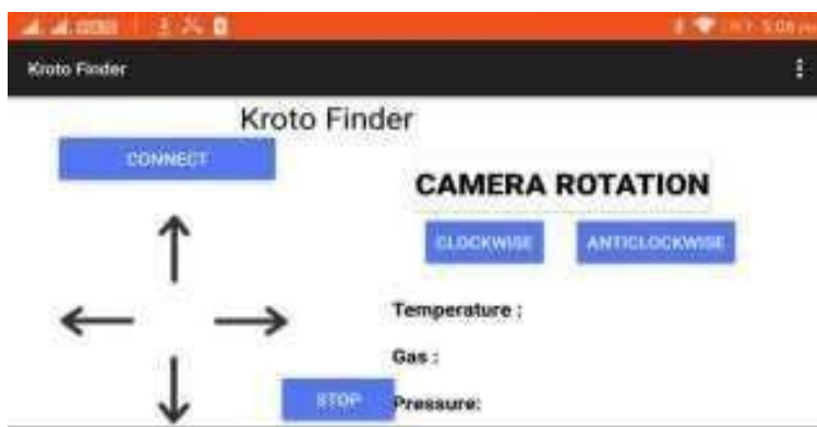
Fig. No.: 3 Display page

The result generated by this project is very simple to understand; here first we connect the robot with the android app through a Bluetooth. Once we pair the Bluetooth of robot and the android phone a connection is established, we can give commands to robot for movement. The robot moves inside an underground pipe gallery collects the results for various inputs and gives the output to the android app. We can also get a live video coverage through the camera that is present in front of the robot. We can even take the screen shots of the faults and the conditions of inside pipe gallery, so that it will give a better test coverage of the defects present in the pipeline and also the cable faults.