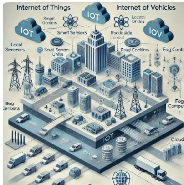
Figure 1: High-Level IoT-IoV Integrated System Architecture