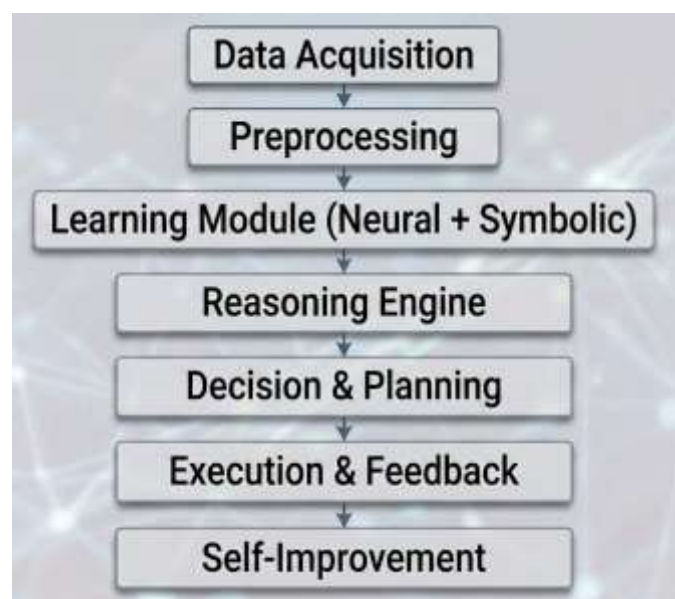
Figure 2: AGI Implementation Workflow