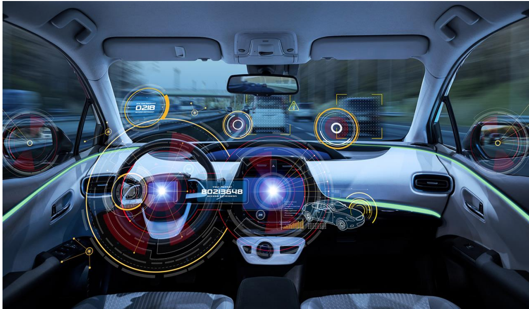
Figure 2: Future of Connected Vehicles with 5g Technology