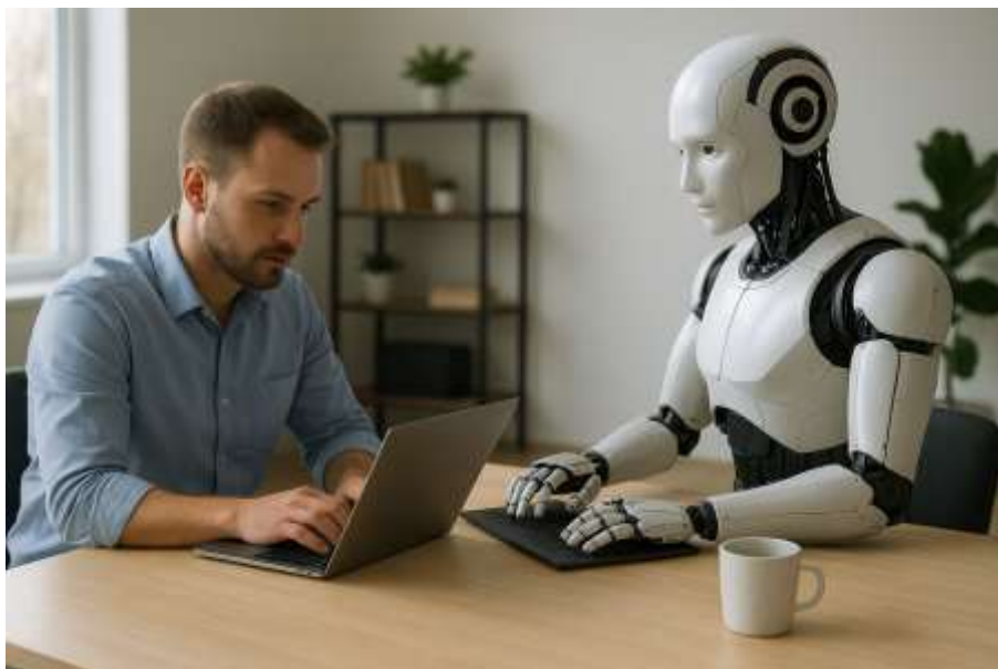
Figure 1. Human–Robot Shared Workspace (Description)